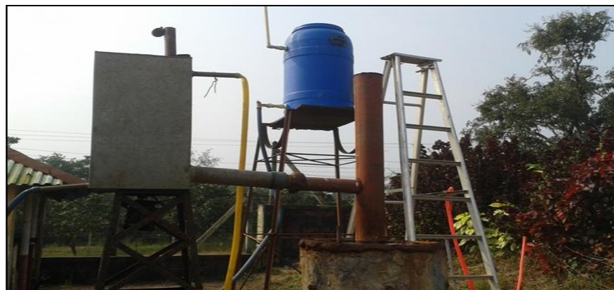
Table.1 Technical specifications of carbonization cum liquefaction unit