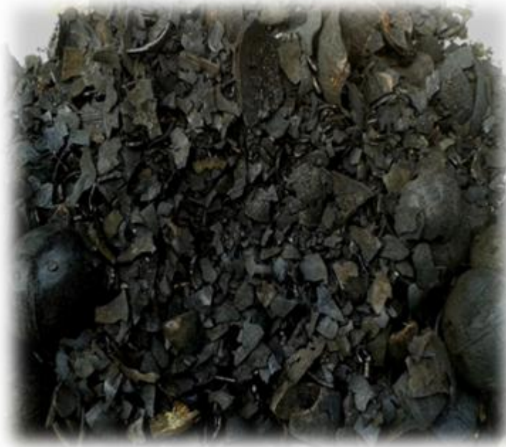
Fig.3 Pictorial view of output after Carbonization from coconut shell