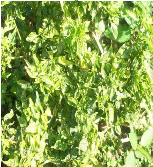
MITES AFFECTED PLANTS