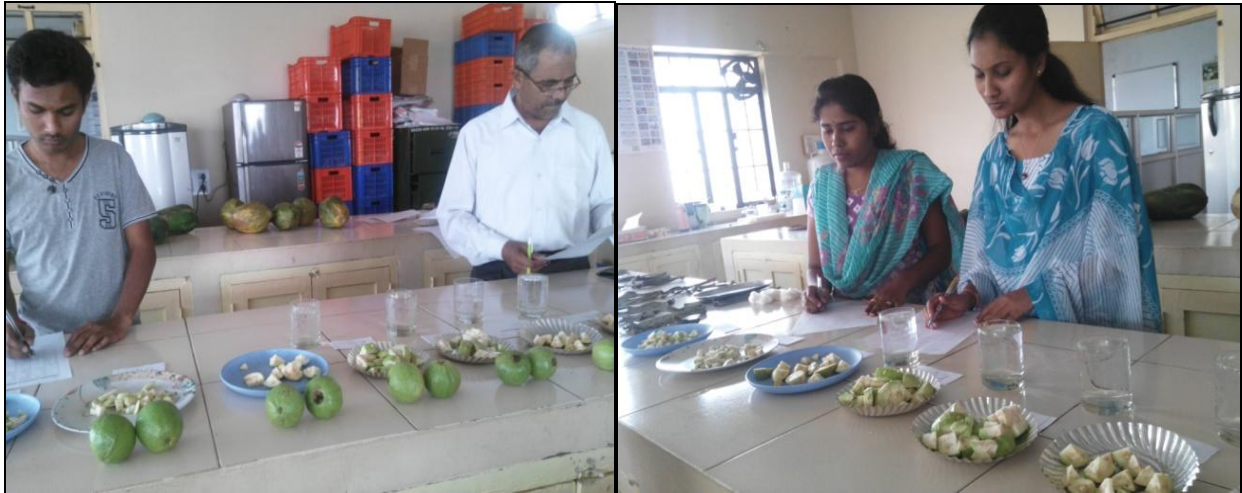
Fig.1 Effect of pruning and bio regulators on quality parameters of guava