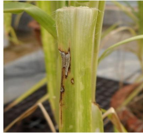
Neck and Finger isolates express symptom on Leaves