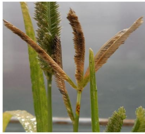
Leaf and Finger isolates express symptom on Neck