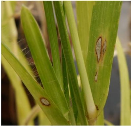
Plate.1 Cross infectivity of leaf, neck and finger blast pathogen from finger millet