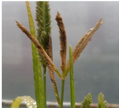
Leaf and Neck isolates express symptom on Finger