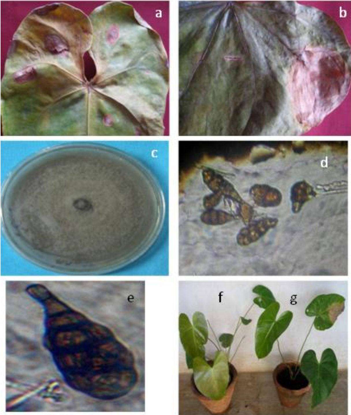
Fig.1 Symptoms of leaf blight disease of anthurium and morphology of Alternaria alternata and morphology of A. alternata a brown spots with concentric rings b marginal blight with concentric rings c colony of A. alternata on PDA d conidial mass of A. alternata e single conidia of A. alternata f healthy anthurium plant g leaf blight of anthurium 14 day after inoculation with A. alternata