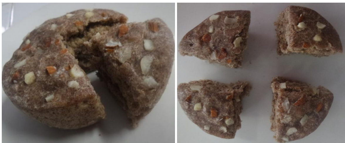
Plate.1 Multigrain bread [Wheat: Kodo millet (50: 50)]