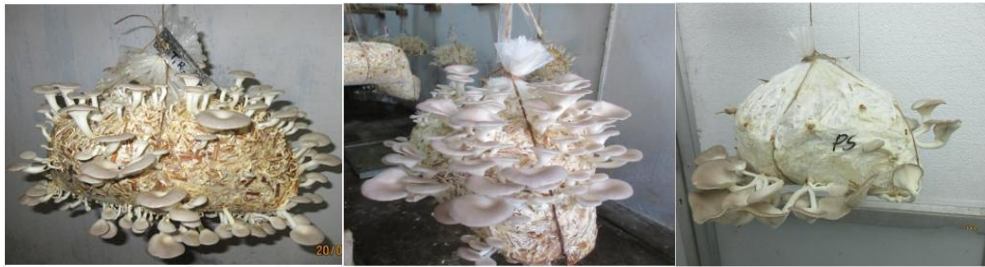
Fig.3 Pleurotus florida cultivation on different substrate i) Paddy Straw ii) Paddy Straw +Sugarcane Bagasse iii) Sugarcane Bagasse