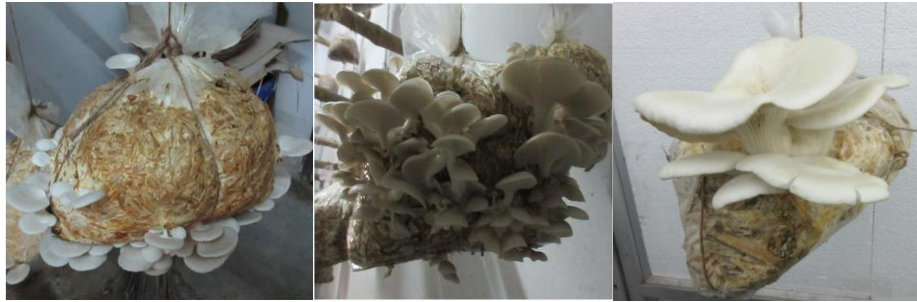
Fig.2 Pleurotus sajor-caju cultivation on different substrates i) Paddy Straw ii) Paddy Straw +Sugarcane Bagasse iii) Sugarcane Bagasse