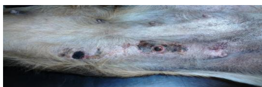
Fig.1 Shows Necrosed teats and lesion around the teats

As we know that the mastitis in canine is an infrequent condition (Schlafer and Miller, 2007). Normally the condition arises due to the bacterial infection of the mammary gland and the mammary tissue (Ververidis et al. , 2007). Staphylococcus aureus is considered as main etiological agent in this present case. The nature of the clinical mastitis in bitches either may be localised or diffuse where single or multiple mammary gland may be infected (Barsanti, 2006). Therapeutic management of mastitis must be initiated immediately by the use of antibiotics whose spectra of action is wide and effective agents the common causative isolates of mastitis (Wiebe and Howard, 2009). For obtaining best result we follow the same principal of treatment in the present case.