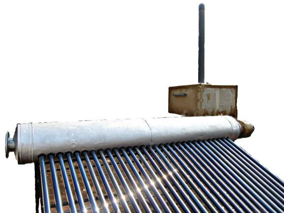
Fig.3 Full load drying chamber