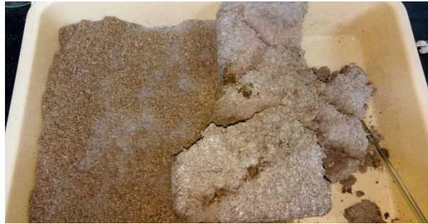
Fig.2 Enzyme extract