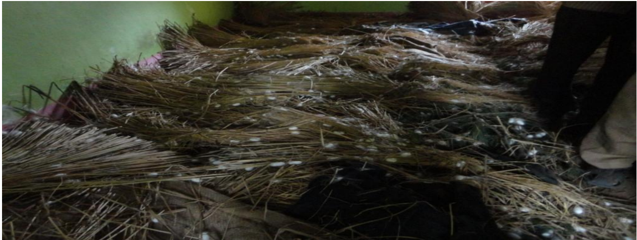
Pinus excelsa used as mounting material / moutage for spinning of silkworm cocoons at farmers place