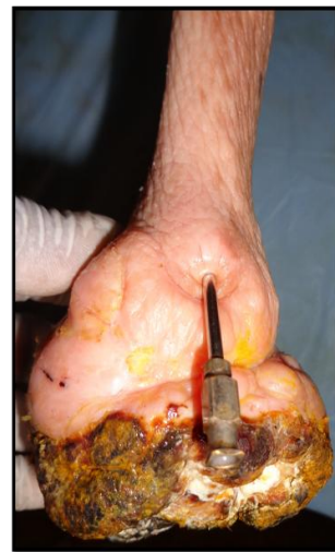
Fig.3 Probing the teat sinus with a sterile teat siphon