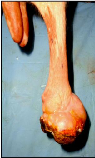
Fig.1 Abnormal mass hanging on the right fore teat