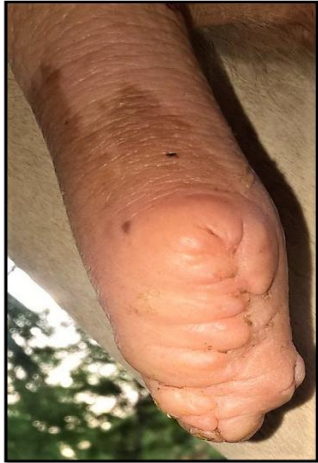
Fig.7 Skin sutures removed on 10 th postoperative day