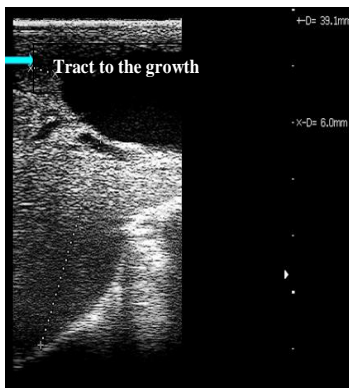
Fig.4 Ultrasound image showing a fistulous tract connecting the teat sinus to the growth