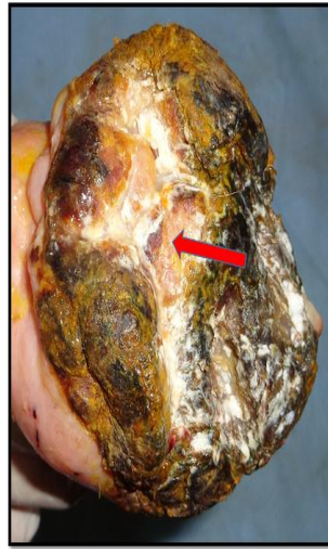
Fig.2 Ulcerated mass with dribbling of milk