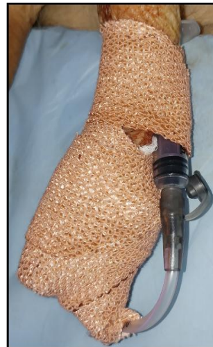
Fig.6 In situ placement of modified PVC tube which was connected to a 2ml disposable syringe and application of Dynafix,