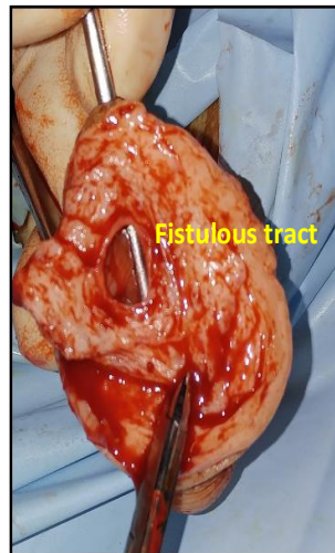
Fig.5 After excision of the growth additional teat orifice other than the normal one was identified