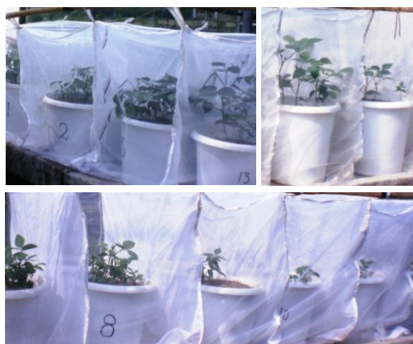
Fig.1 Screening of mungbean genotypes for resistance against MYMV under screen-house conditions