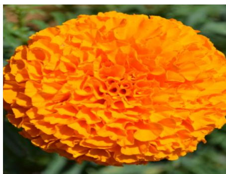
Fig.1 Marigold cv. ‘Arka Agni’

2 Shoot differentiation Rate (%) = (No. of callus generating shoots in differentiation medium / No. of callus inoculated) × 100