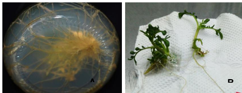
A) Rooting on MS media without plant growth regulators B) Rooting on MS media supplemented with 1.47 \mu\text{M} IBA