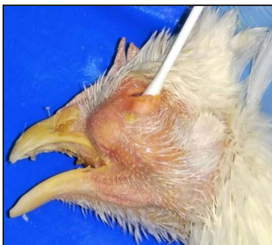
Fig.1 Collection of swab from conjunctival sac of affected layer bird