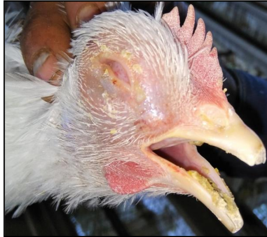
Fig.3 Bird with unilateral swelling of wattle