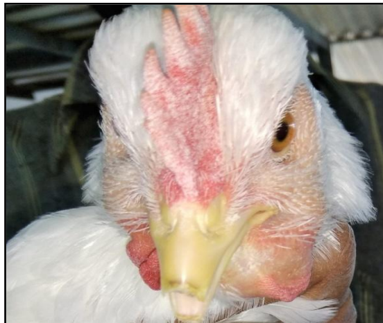
Fig.4 Bird affected with IC having caseous material in infra orbital sinus