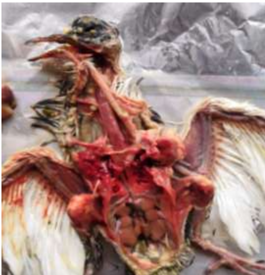
Fig.1 Pigeon-Pox – yellowish cutaneous lesions

revealed no diphtheritic lesions either in the upper respiratory tract or digestive tract. However mild congestion was noticed in almost organs. Heart contained partially clotted blood (Fig. 1). The intestinal contents were yellowish in colour and watery in consistency which on microscopic examination revealed no endoparasites. Histological examination of skin lesions revealed viral intracytoplasmic inclusion bodies in epidermal cells (Fig. 2). The present findings were in accordance with the findings of Mohan and Fernandez (2008) who reported two cases of cutaneous form of pox infections in local pigeons. The birds were dehydrated and emaciated in nature. Several 0.5- 1 cm diameter coalescing, round, yellowish, rough and firm masses were found at the eyelids, beak, and the mouth, and some were superficially ulcerated. They also observed no diphtheritic lesions in affected birds as observed in the present study. Viral intracytoplasmic inclusions were demonstrated in epidermal cells as confirmed in the present case.