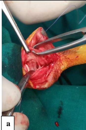
Fig.4 Intra-operative image showing (a) trochlea and (b) suturing of tendon sheath with periosteum of epicondyle.