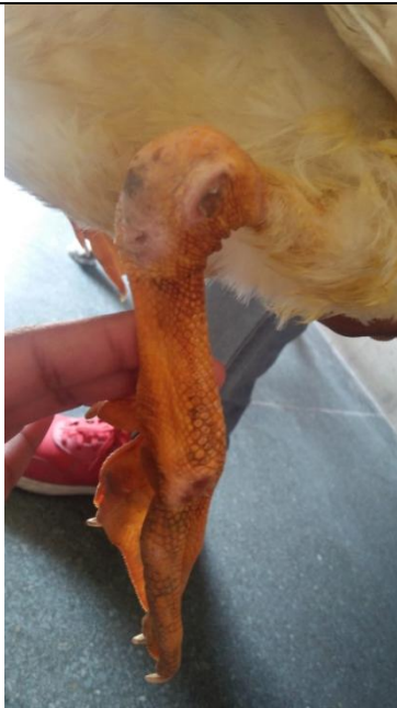
Fig.1 Swelling of right hock joint with skin discolouration

(Bennett, 1997). Tendon was first freed of adhesions and returned to correct position within trochlear groove. As the trochlear groove was shallow it was deepened and tendon sheath was Sutured to lateral periosteum (Fig. 4b) through a tunnel in the lateral epicondyle produced using a 20 gauge needle by 3-0 absorbable suture in simple interrupted pattern (Olsen, 1994 and coles, 1997) (Fig. 5). Skin incision was Closed in simple interrupted pattern by 4-0 non-absorbable suture (Fig. 6). Leg was bandaged in flexed position and splint applied for approximately one week. Antibiotic cefotaxime @100mg/kg body weight intramuscularly (Ritchie et al. , 1994) for 5 days and meloxicam @0.1mg/kg p.o for 3 days (Machin, 2005) was prescribed. Manganese rich diet (rice and chickpeas) was also included in ration of duck.