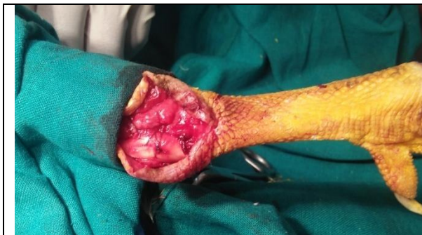
Fig.5 Simple interrupted suture pattern for stacking of tendon sheath to periosteum.