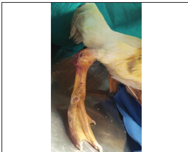
Fig.7 One week post-operative image showing in place Achilles tendon and normalised hock.