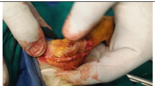
Fig.6 Skin closure with non-absorbable suture material in simple interrupted pattern.