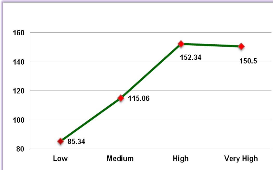
Fig.2 Seedling vigour at different seedling categories at nursery stages of cocoa