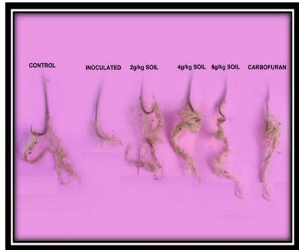
Plate-1 Effect of Pseudomonas fluorescens against root knot nematode ( Meloidogyne incognita ) as soil treatment in tomato Shoot and Root.