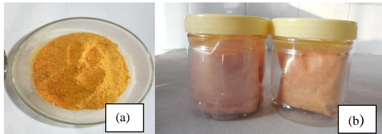
Fig.2 Instant papaya halwa prepared from Instant halwa mix from papaya powder