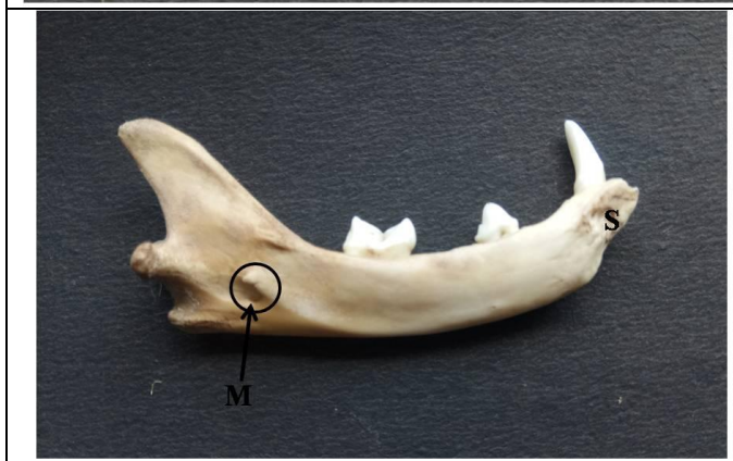
Fig.3 Medial surface of mandible showing mandibular foramen (M) and irregular symphyseal border (S)

The articular extremity of vertical ramus presented a non-articular coronoid process and an articular condyle separated by mandibular notch (Fig. 2). Coronoid process was wide below and tapering above. It was triangular in lateral view (Fig. 2). It was flattened from side to side. The condyle was present behind the coronoid process. It was transversely elongated convex articular process that forms temporo-mandibular articulation with squamous temporal bone.