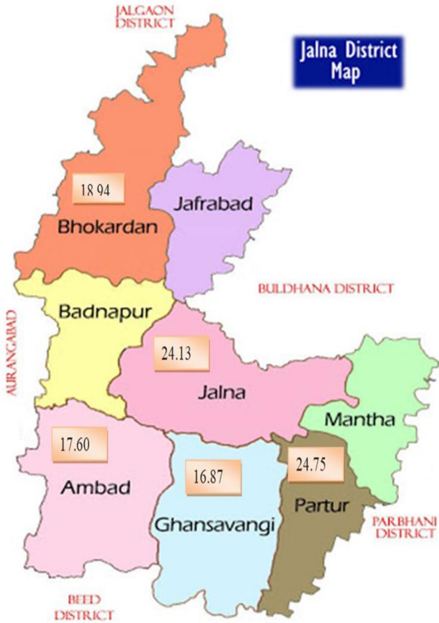
Fig. 1 -Map of Tahsils Surveyed in Jalna district showed Powdery mildew disease severity