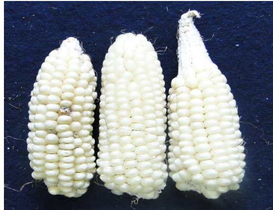
(a) TLB-6 (VL-1018527)