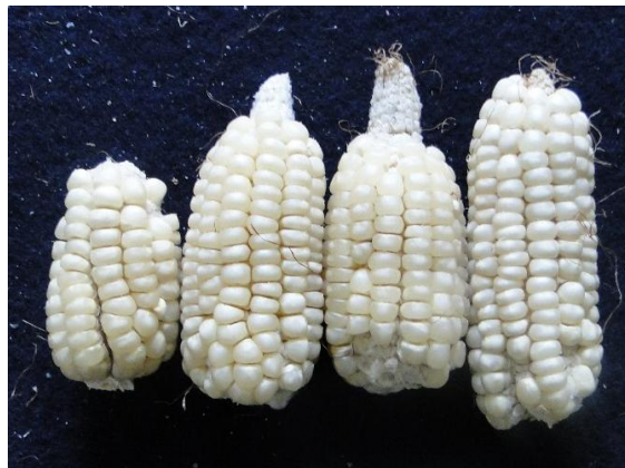
b) TLB-16 (VL-0536)