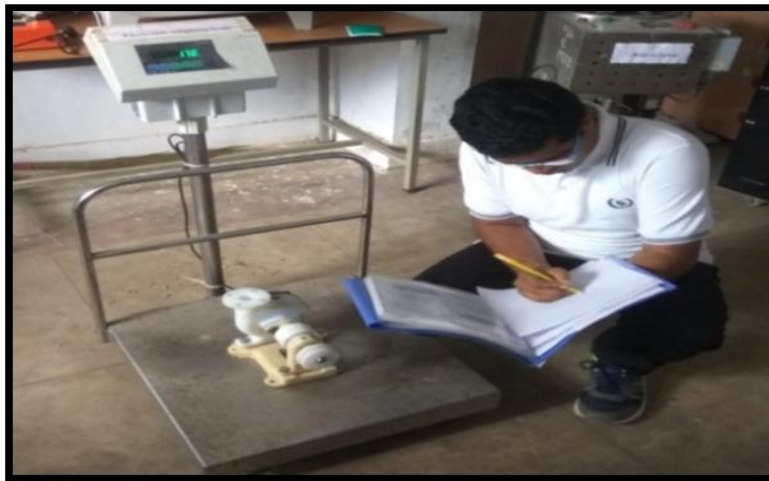
Plate.7 Polymer pump in operation in laboratory