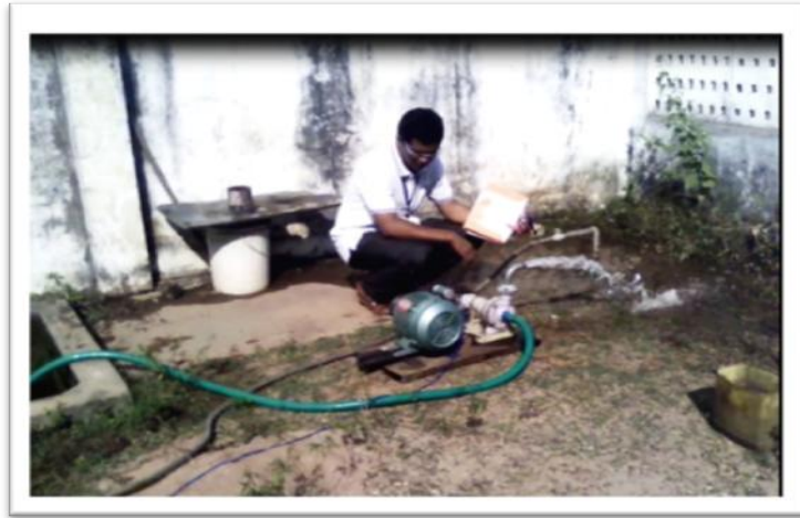
Plate.9 Measuring the distance of stream flow of polymer centrifugal pump