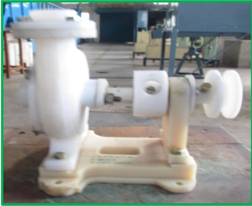
Plate.4 Components of polymer casted centrifugal pump