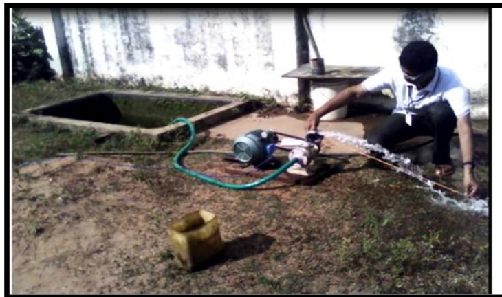
Plate.10 Metal centrifugal pump setup for experiment at an open well