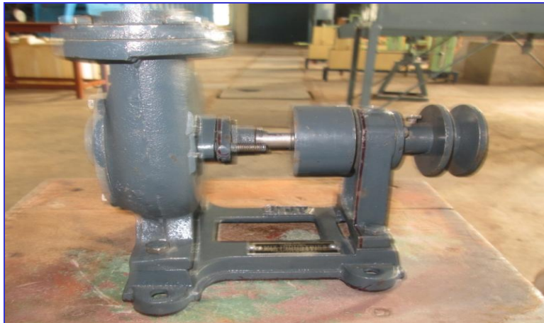
Plate.2 Components of the selected metal centrifugal pump