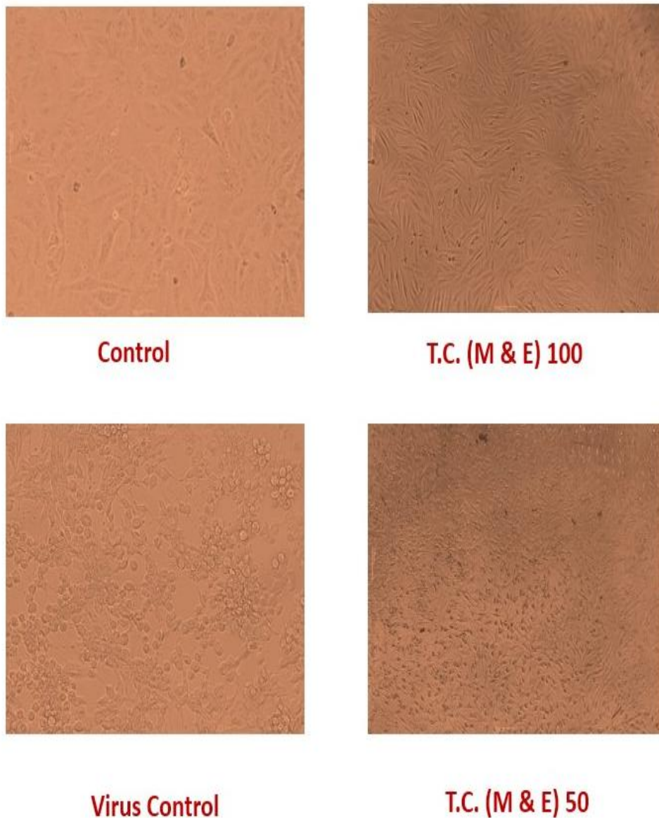
Fig.3 Inhibitory activity of test substances against HSV-1 induced cytopathic effect

The Preliminary photochemical analysis confirmed the presence of saponins, alkaloids, phytosterols and triterpinoids in the crude extract obtained from T.cordifolia using methanol and ethyl acetate. Cytotoxicity