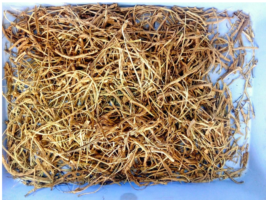
Fig.1 Dry stem of T.cordifolia