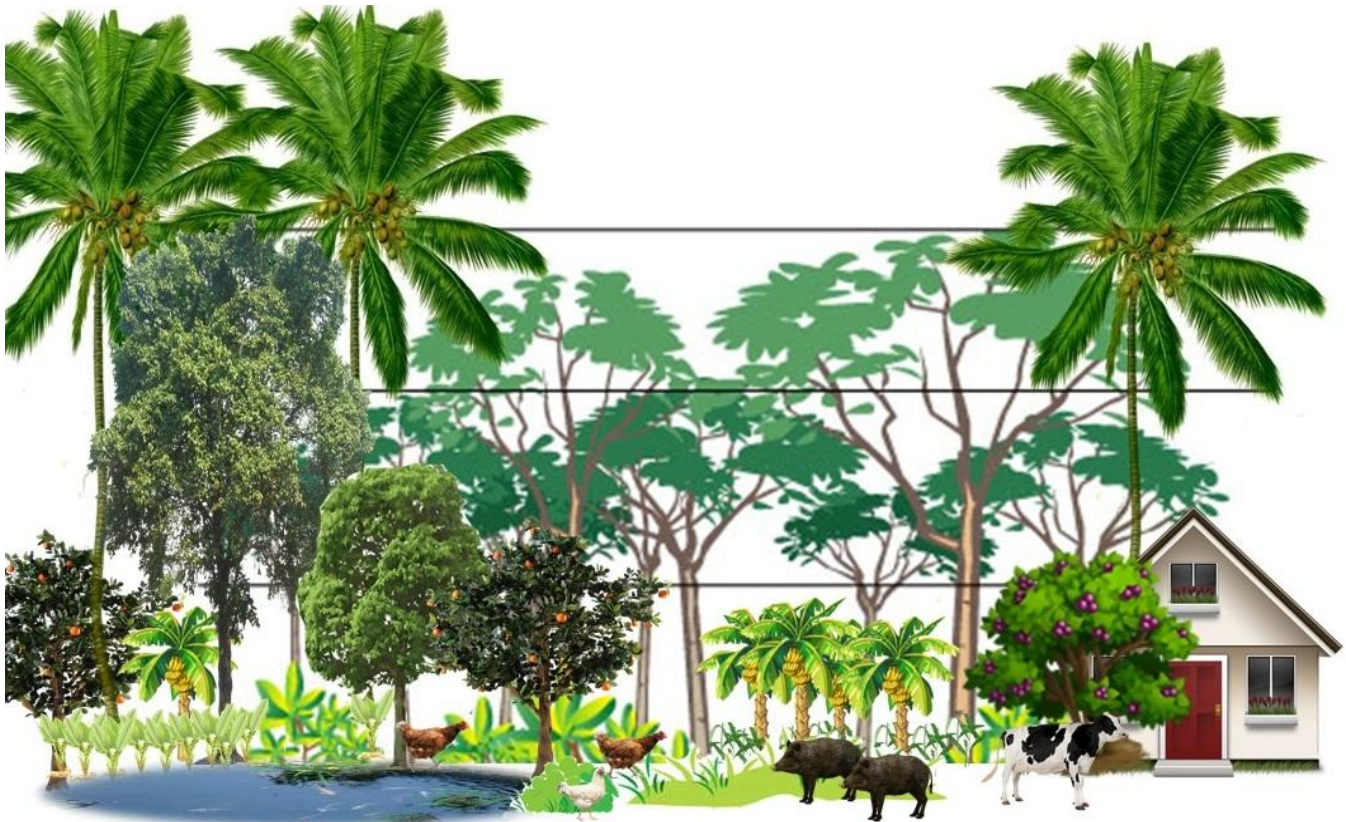
Fig.1 Tropical Homegardens: Multistrata composition of various components (Coconut, Mahogany, Papaya, Banana with intercropping of medicinal plants) with animal husbandry, piggery and fisheries component