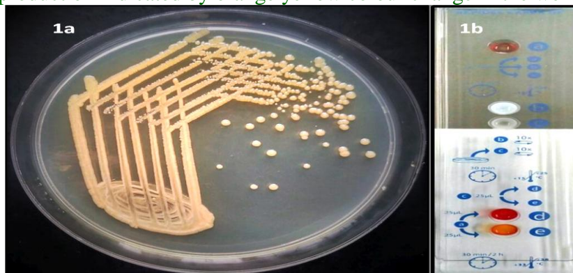
Fig.1a and 1b 1 (a) shows 2-3 mm dome shaped pale yellow colonies of Myroides odoratimimus on nutrient agar. 1 (b) RAPIDEC® CARBA NP test showing positive result for carbapenemase production indicated by orange yellow colour change in the well e

Abbreviations: R - Resistant, S - Susceptible