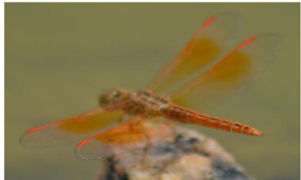
Plate 1: Some Butterflies and Draganflies recorded in Kondhagai pond A&B during the study period