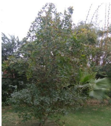
Fig.2 NAT leaves showing morphology