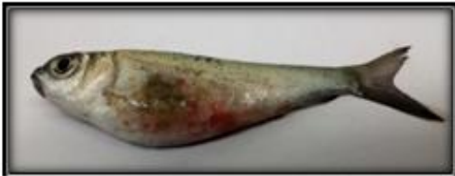
Fig.1 Hemorrhage over the abdomen