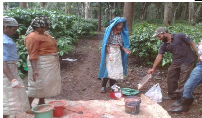
Fertilizer for soil application - conventional practice