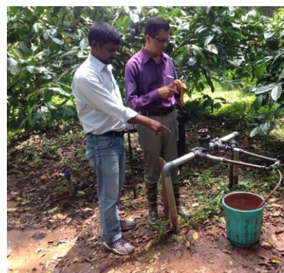
Drip fertigation through venturi