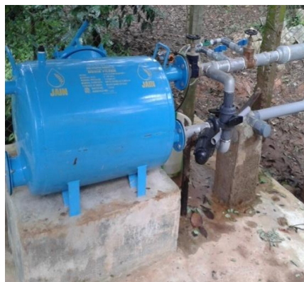
Micro Irrigation System Unit