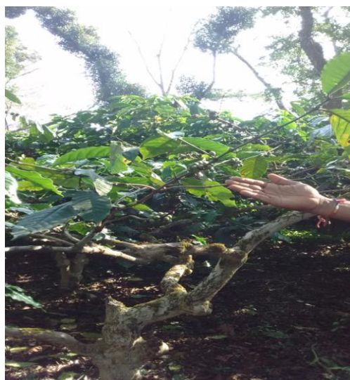
Plate.2 and 3 Control plant with minimum fruits and drip fertigated coffee plant with more fruits