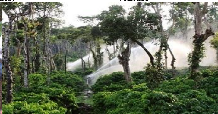
Sprinkler irrigation through rain gun