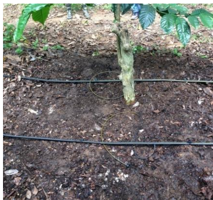
Drip irrigation (paired drip lines)