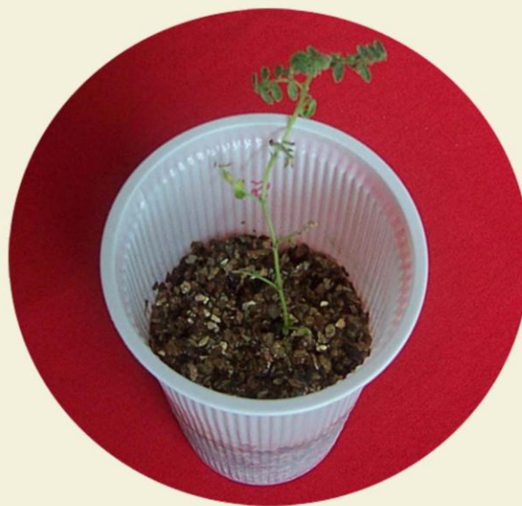
Fig 3: Well established In-vitro generated seedlings in potting medium.