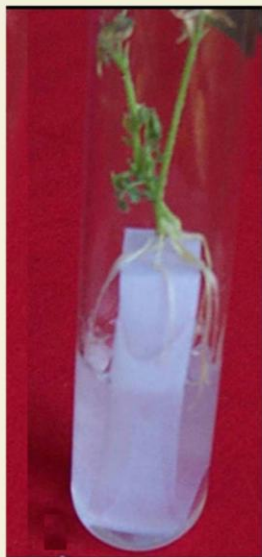
Fig 2: Responce of Chickpea to rooting as influenced by auxin