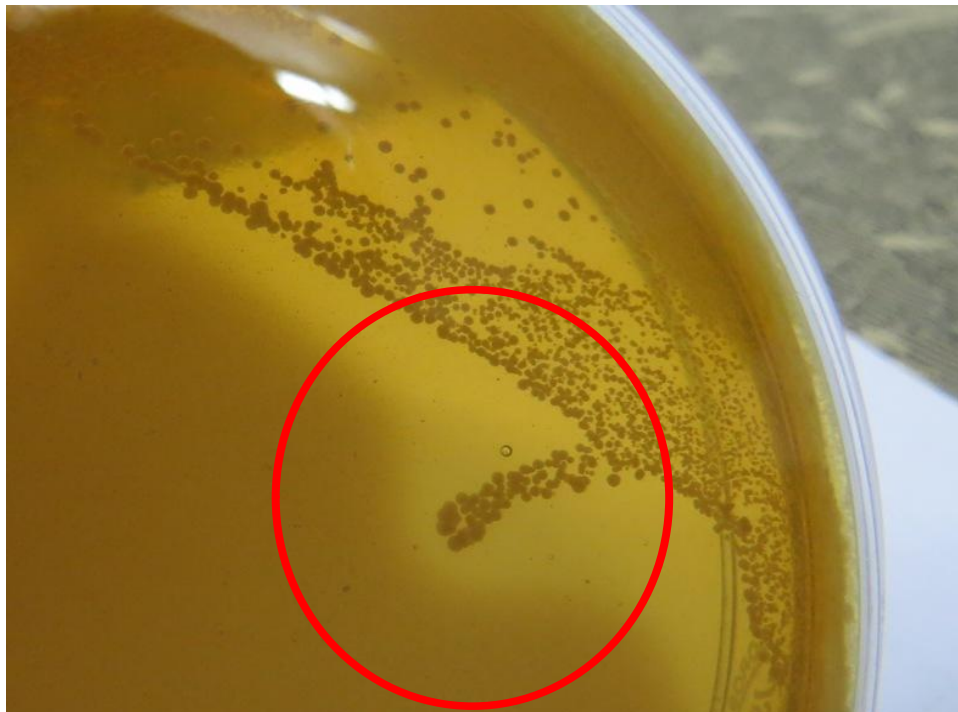
Fig.1 Growth of Leuconostoc mesenteroides sub sp. mesenteroides on MRS agar

Isolate was tested for their antimicrobial resistant against different antibiotics using octadisc. Cells were sensitive to all tested antibiotic viz. Imipenem, Meropenem, Ciprofloxacin, Tobramycin, Moxifloxacin, Ofloxacin, Sparfloxacin, Levofloxacin, Ciprofloxacin, Ofloxacin, Sparfloxacin, Gatifloxacin, Teicoplanin, Azithromycin, Vancomycin, DoxycyclineHcl, Ampicillin, Ciprofloxacin, Colistin, Co-Trimoxazole, Gentamicin, Nitrofurantoin, Streptomycin, Tetracycline (Table 2).