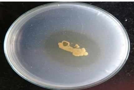
Potassium solubilization by Asp1 fungi