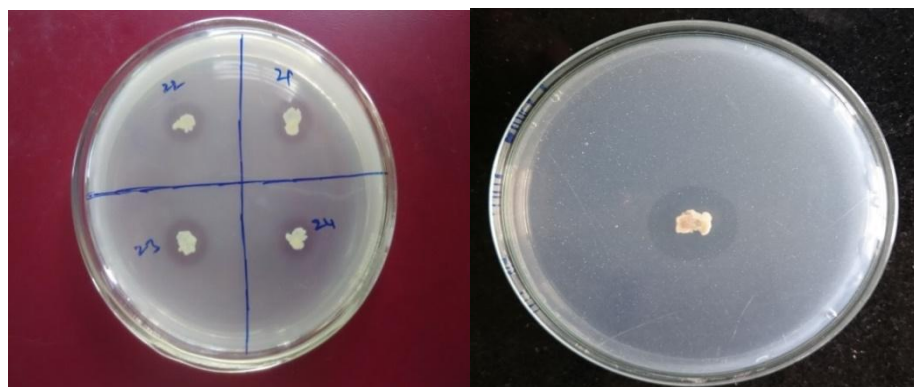
Phosphate solubilization by PSB bacteria