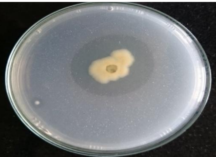
Zinc solubilization by Asp1 fungi