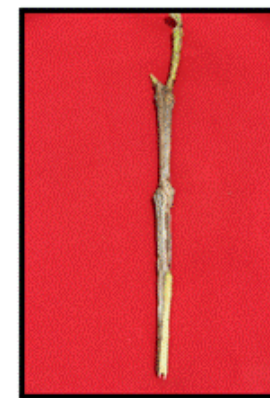
5. Prepared scion for grafting