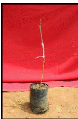
7. Graft union tied with polythene tape