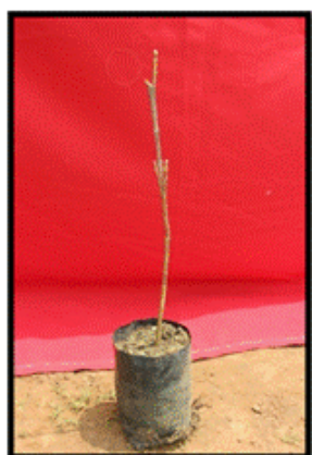
6. Insertion of scion on to the rootstock