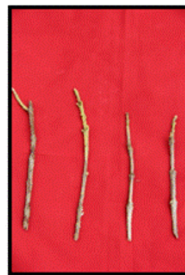
4. Prepared scions