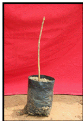
2. Beheaded rootstock