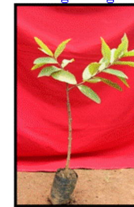
10. Successful graft