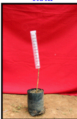
8. Scion stick covered with poly cap