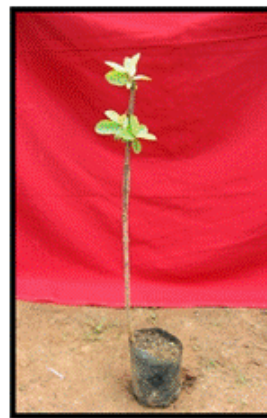
9. Sprouted graft