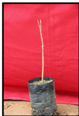
3. Splitting of rootstock