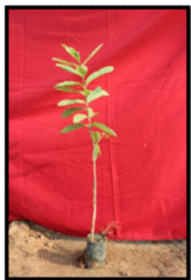
1. Selected rootstock