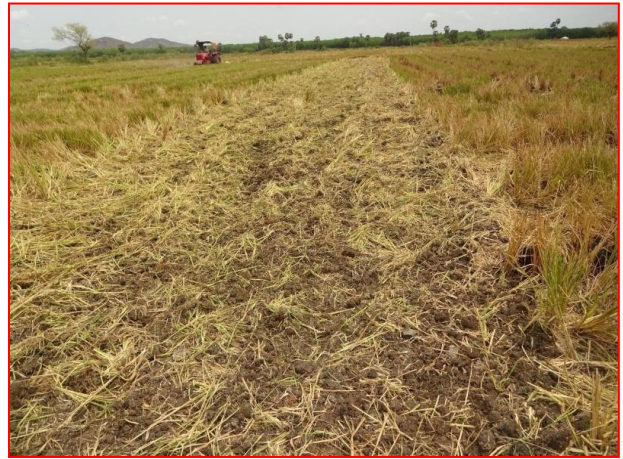
Plate.5 Land before and after ploughing at College of Agricultural Engineering, Bapatla