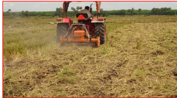
Plate.2 Measurement of width of cut in black soil and sandy soil