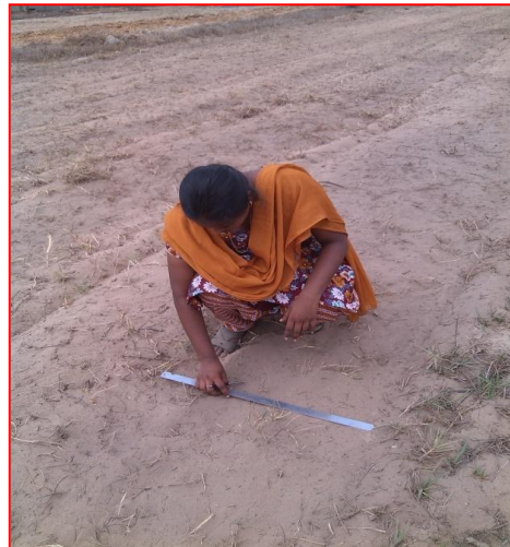
Plate.3 Measurement of depth of cut in black soil and sandy soil