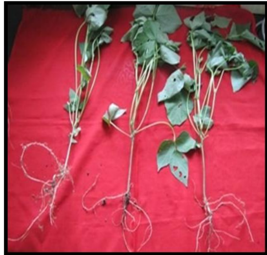
Plant uprooted at 45