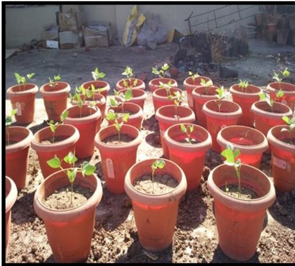
Mungbean plant in pot