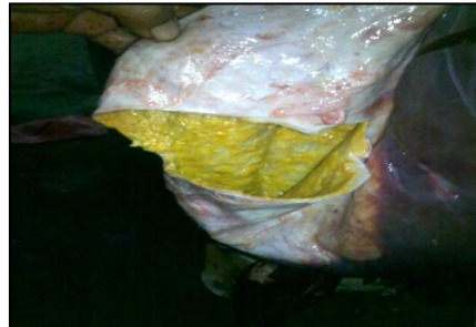
Fig.3 Necrosis and Hydatidosis