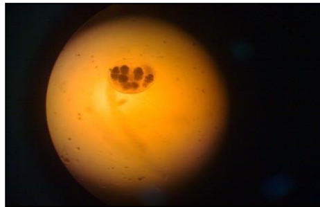
Fig.2 containe of Hydated cyst