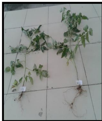
90 day plants

There are several reports on plant growth promotion by bacteria that have the ability to solubilise inorganic and/or organic P from soil after their inoculation into soil or plant seeds promoting plant growth and crop production was augmented considerably (Kucey et al. , 1989; Bhattacharya et al. , 1986). Inoculation of phosphate solubilizing bacteria like Serratia marcescens , pseudomonas fluorescens and Bacillus spp. improved the phosphorous uptake of shoot