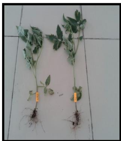
45 day plants