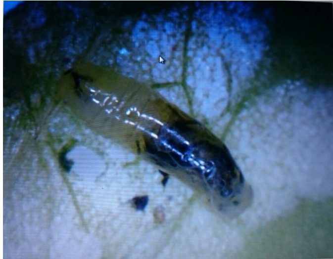
Fig.3 Pupa of L. trifolii