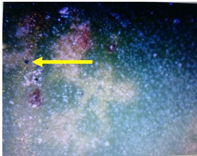
Fig.2 Larvae of L. trifolii