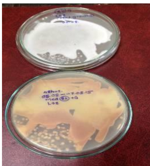
Fig.2 Laccase Positive Activity in the Broth with Guaiacol