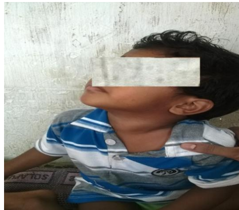
Figure.3 Swelling of Neck (Bull's neck)