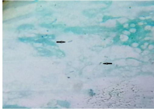
Figure.5 Gram's Stain Showing Dumbbell Shaped Gram Positive Bacilli