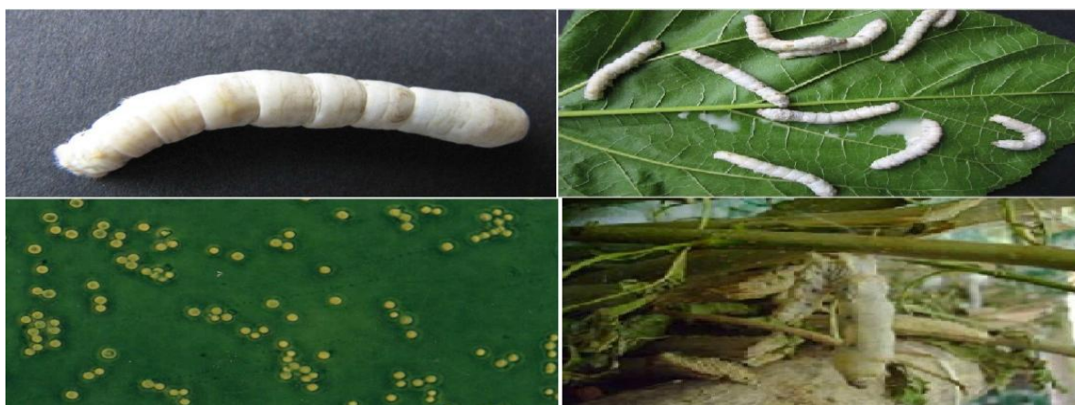
Fig.1 A. Grasserie larva B. Oozing of milky fluid C. Polyhedron of BmNPV and D. Hanging of diseased larva

Presence of fruiting bodies in the haemolymph of infected larvae confirmed the presence of BmNPV infection (Fig.5).