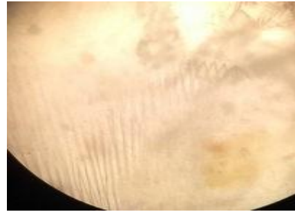
Fig.3 Polyhedral structure observed in the haemolymph of diseased larva