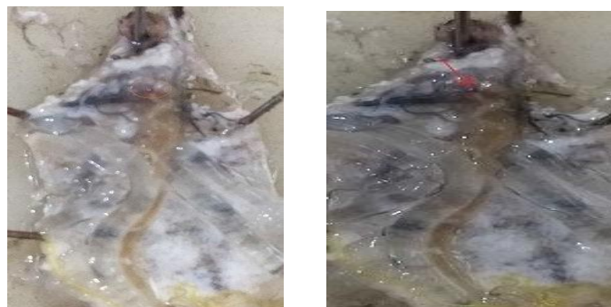
Fig.5 Fruiting bodies indicating the BmNPV infection