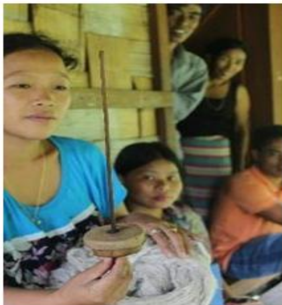
Fig.3 Hand Spinning (tat satou)