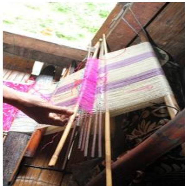
Fig.4 Local handloom (Tat Tui)