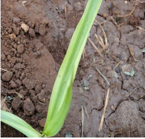
Plate.1 Chlorophyll mutants in M<sub>1</sub>V<sub>2</sub> generation