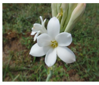
Control with six tepal