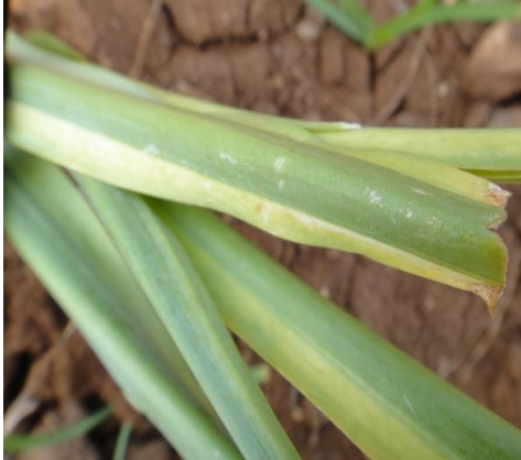
T<sub>4</sub> (1.5 kR gamma ray) - Striata