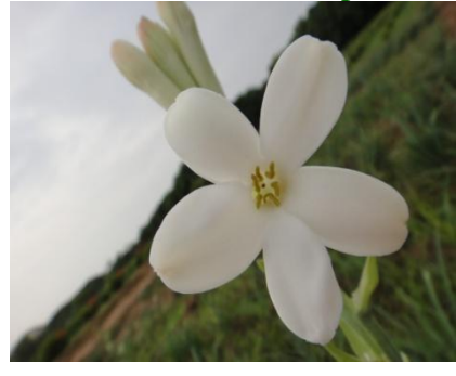
5 tepal ( T_3 to T_{14} )