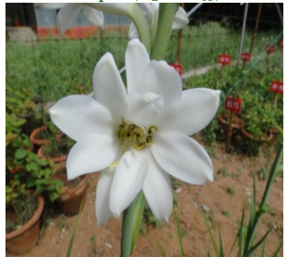
T_{7} - (15 mM DES) – 11 tepal floret