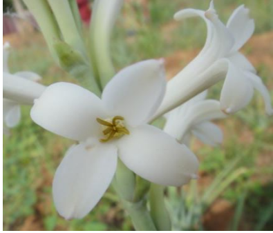
4 tepal ( T_3 to T_{14} )

A non flowering spike was recorded in 25 mM DES. Similar result was reported by Sambanthamurthi (1983).